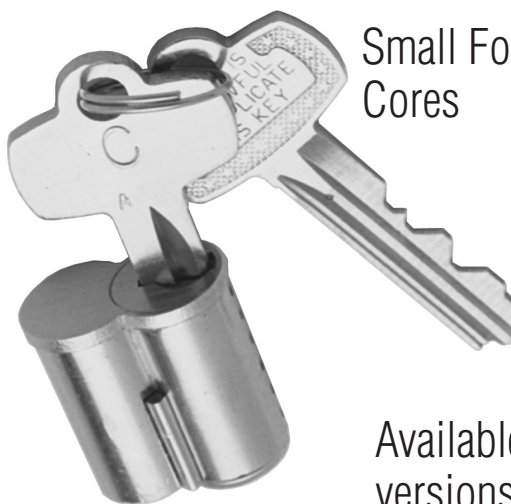
Small Format IC Cores