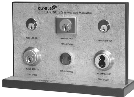
FDB-003 Large Pin/Schlage LFC