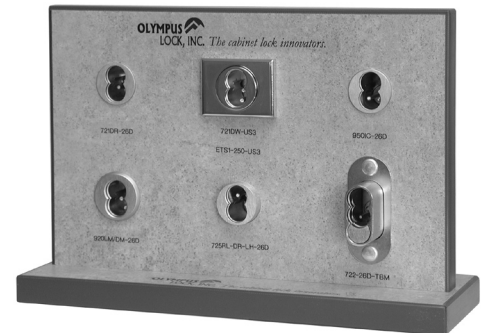
FDB-004 Small Format IC Core