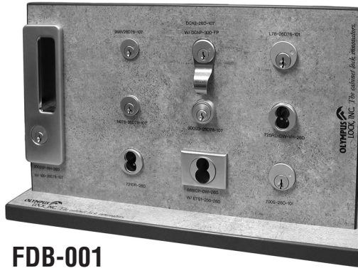
FDB-001 All Locks