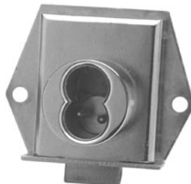
725ML Mortise Latch, Inverted