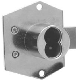
725RD Rim Deadbolt, Left Hand

Unlike BEST, Olympus offers our lock in a dedicated door function. BEST originals require you to mount the lock on its side!