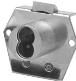
725RL Rim Latch, Vertical